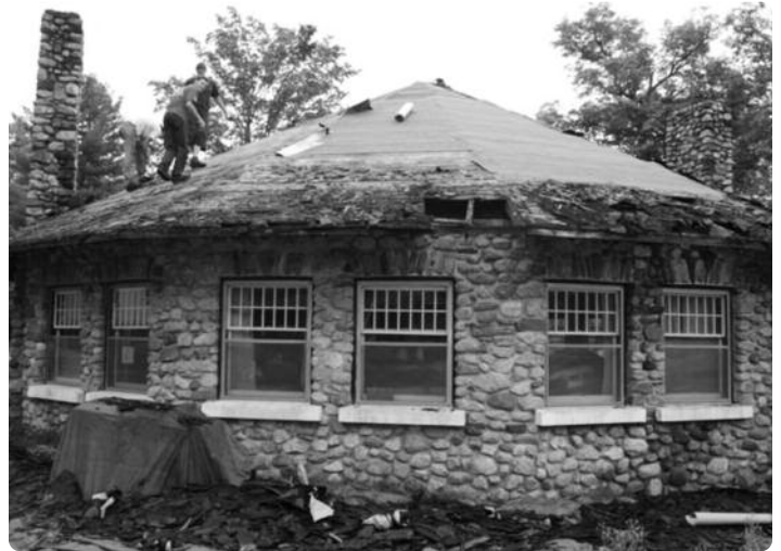
Work started on the Bigwin Tea Room in late September.

The Bigwin Tea Room is being restored to serve members and property owners of the Bigwin Island Golf Club. This unique octagonal stone building is one of the original structures of the old hotel and features the Arts and Crafts style and beautifully crafted stone fireplaces that signify the classic Bigwin look. Situated just east of where the Rotunda once stood, the Tea Room originally served as a daytime restaurant for light lunches and an ice cream parlour. When the Rotunda was demolished last year, care was taken to preserve several of the stone fireplaces as landscape features within an outdoor area now called the Rotunda Gardens. According to Dave Smith, vice president of Bigwin Island Golf Club, plans are being considered to connect the Tea Room and the Rotunda Gardens with landscaping, creating a new indoor-outdoor venue for special events. The project has required extensive repairs to the roof and interior, but it will be worth it, says Smith. "Preserving this building is a wonderful way to highlight the heritage of the Bigwin facility."